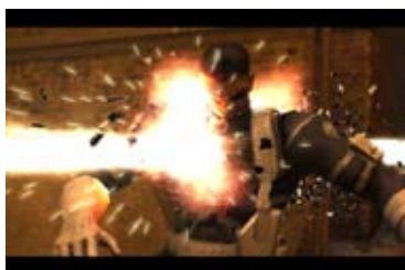
MUA2 Redemption (00:33-00:40)

Responsible for: Compositing Demonstrates: Green Screen Extration/Integration, "Platinum" Treatment, Paint/Clean-Up, Color Correction Software Used: Shake