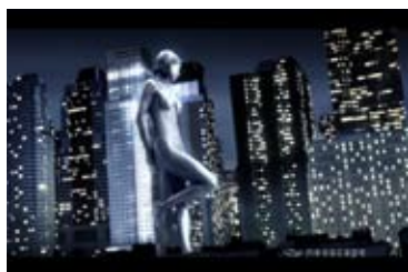
Platinum Shot 40 (00:22-00:33)

Responsible for: Rendering, Compositing Demonstrates: Multi-Layer Effects Compositing, Rendering in Layers, Software Used: 3DS Max, After Effects