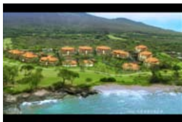
Maluaka Aerial (00:06-00:12)

Responsible for: Compositing Demonstrates: Paint/Roto, Multi-Layer Compositing, Color Correction Software Used: Shake, After Effects