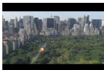
Nuke in Nuke (01:09-01:17)

Responsible for: Rendering, Compositing Demonstrates: Multi-Layer Effects Compositing, Rendering in Layers, Software Used: 3DS Max, After Effects