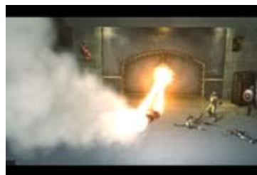
MUA2 Secret War Intro I (00:49-00:57)

Responsible for: Compositing Demonstrates: Green Screen Extration/Integration, Color Correction, Blemish Removal Software Used: Shake